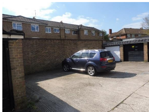
Structure belonging to 1-18 Swan Court which abuts garage block