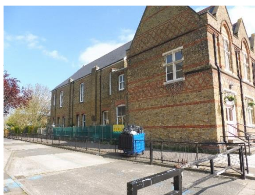
Isleworth Public Hall