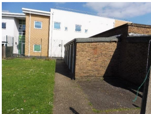
Structure belonging to 1-18 Swan Court which abuts garage block