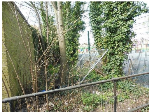
Land lying to the north of South Street