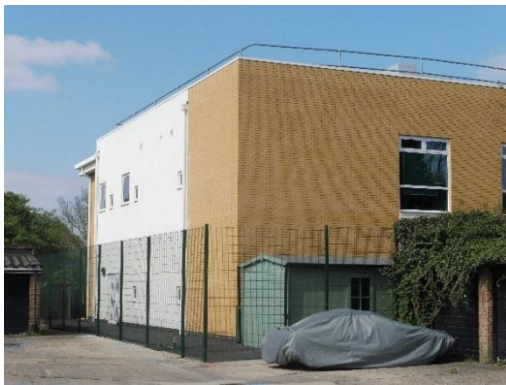
St Marys Junior Infant & Nursery School