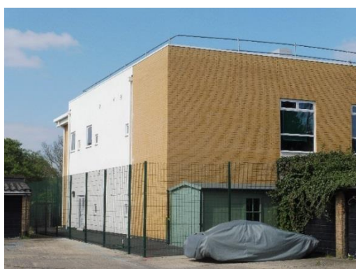
St Marys School