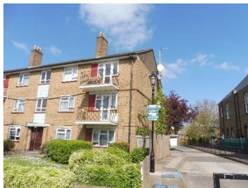
1-18 Swan Court